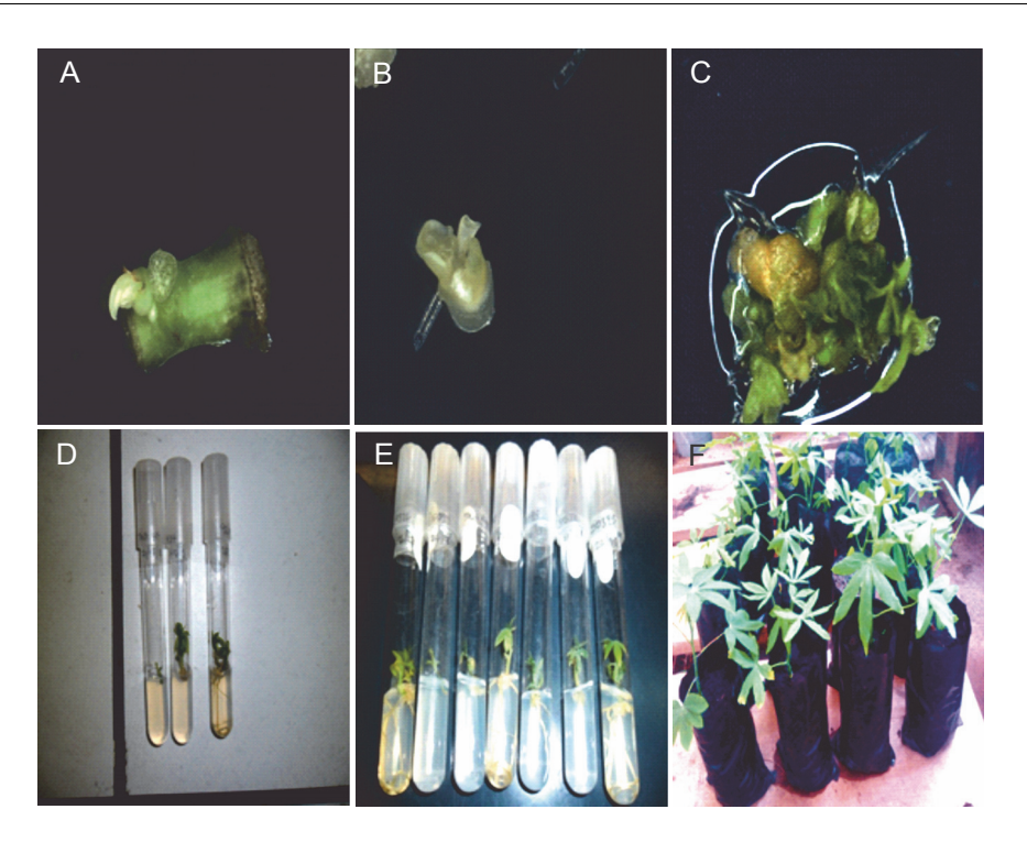
Fig. 1. Multiple shoot induction in UMUCASS 36: A) enlarged axillary bud; B) isolated axillary bud on induction medium; C) multiple shootbud emerging after 3 weeks of growth; D) elongated shoot on elongating medium; E) regenerated shoots producing roots and F) regenerated plants following acclimatization in a containment facility

produced roots (Fig. 1E) at the 6<sup>th</sup> and 8<sup>th</sup> weeks, respectively, and formed growing young plants (Fig. 1F) following acclimatization.