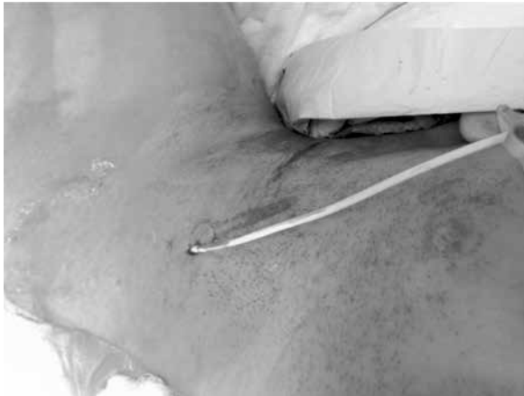
Figure 1. Patient's head on the right side: Cordis sheath at this stage removed, knotted PAC stuck at 10 cm at skin level